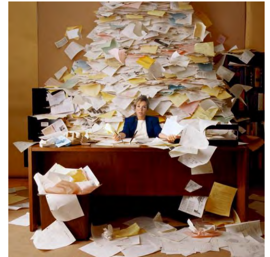
Submissions to government departments