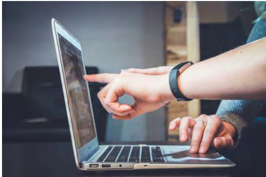
Hours of research